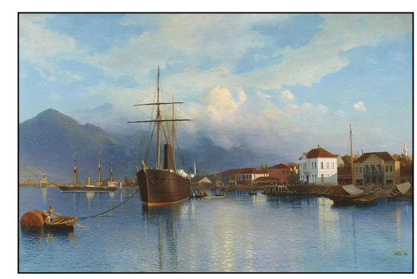
Port of Batumi in 1861

In Batumi, they were joined by many other Russian Molokan and Subbotnik families from the Kars {Turkey} and Yerevan {Armenia} regions. Many elders, friends and relatives accompanied the emigrants, singing most of the way.